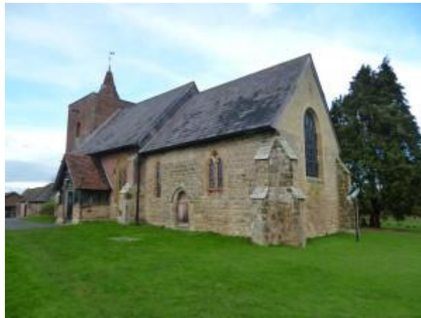
All Saints' Church, Tudeley